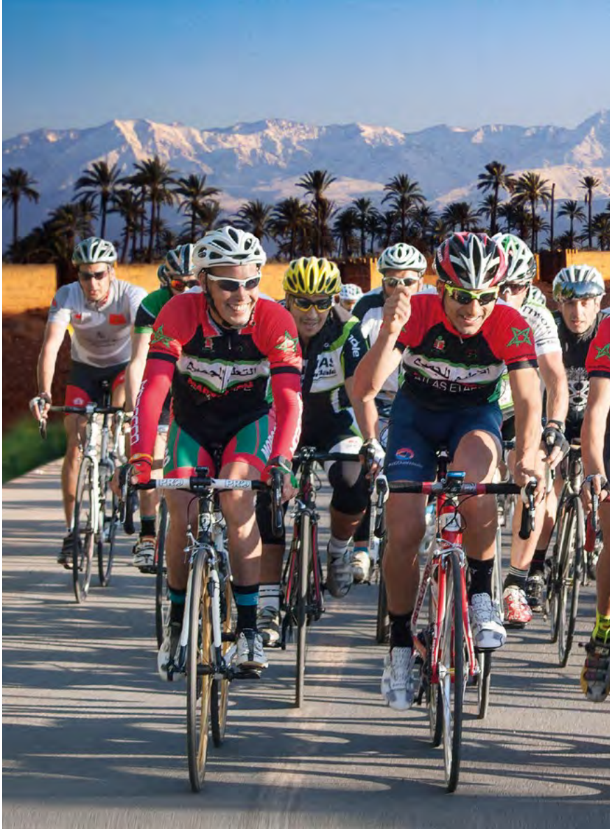
Marrakech Atlas Etape, annual cyclo sportive, last Sunday in April